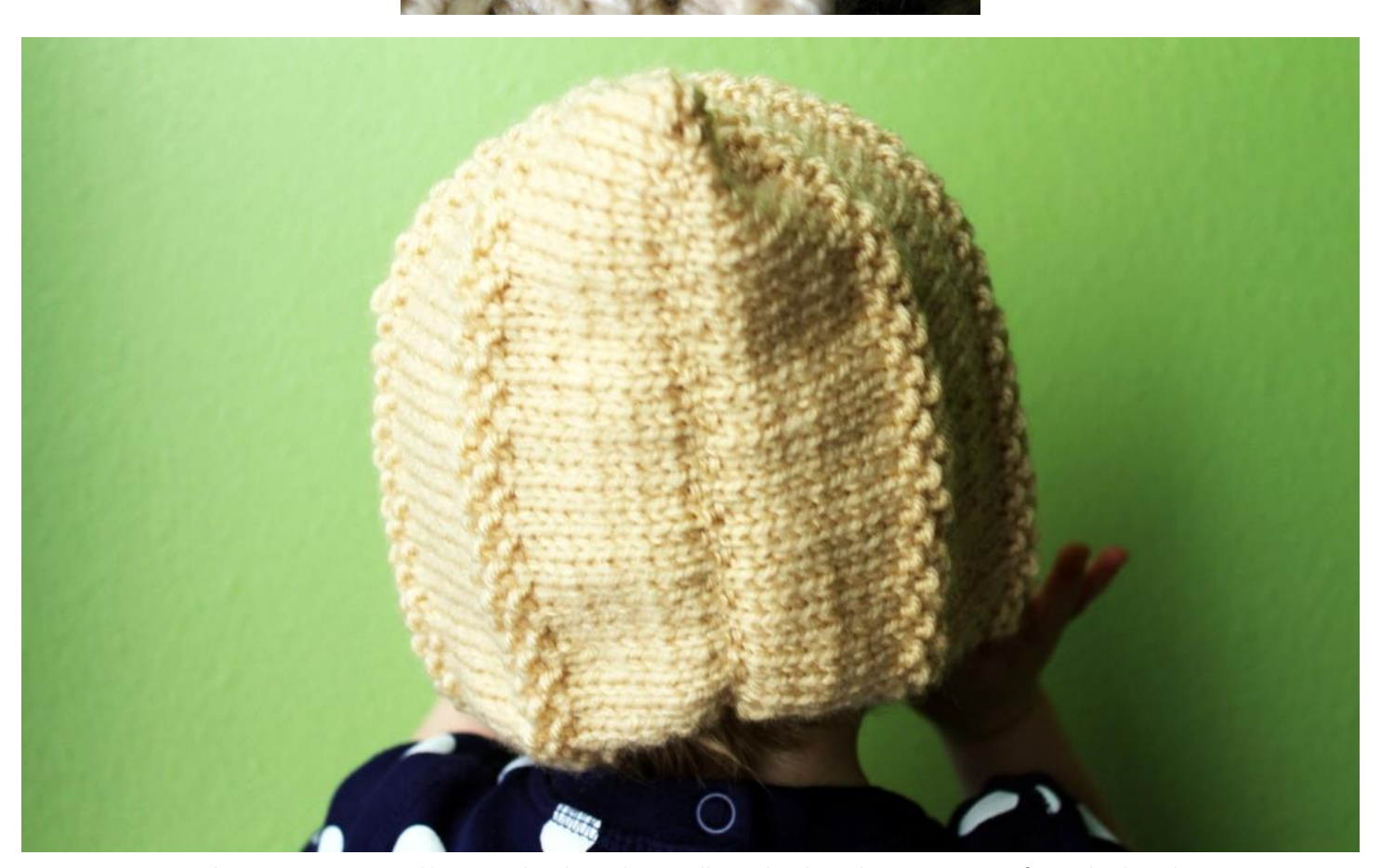
This pattern is protected by copyright. Please do not sell or redistribute this pattern in any form. Thank you!